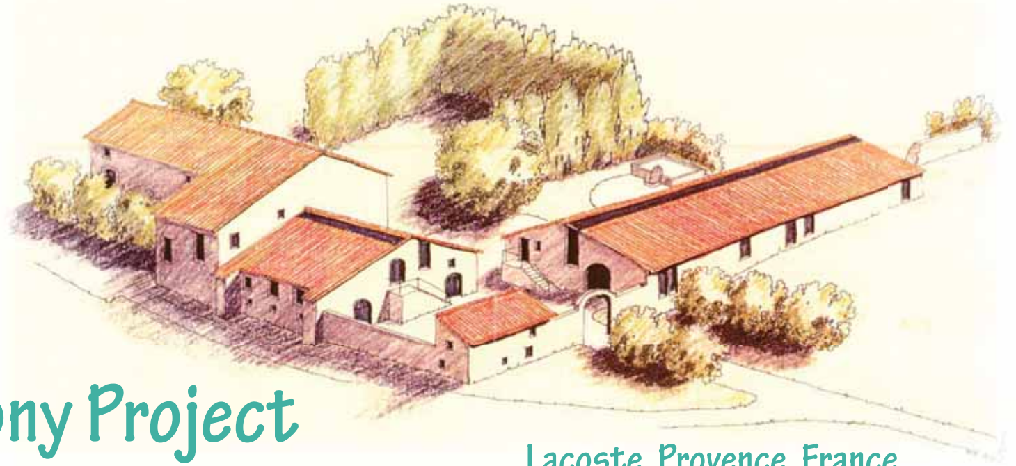
Lacoste, Provence, France

Situated in a broad valley between the village of Lacoste (photo page three) and the neighboring village of Bonnieux in Provence, France, the Maison Basse is a standing and intact remnant of medieval European life and earlier agrarian activities. Today, verdant vineyards of wine grapes and lush arbors of mature cherry and almond trees surround the ancient maison (sketch above). The valley is a colorful patchwork of farms, hearty fields, and stands of oak and pine.